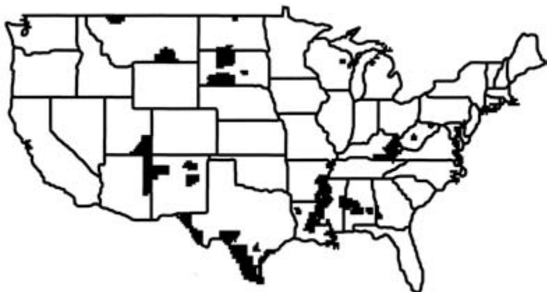
Fig. 3.2 Poverty in the “globalized” internal economy: Counties with a more than 35 percent poverty rate

sippi, and Louisiana and in the “black belt” of Alabama, all of which have large proportions of African Americans (>35 percent)