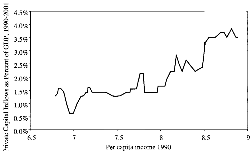
Fig. 3.1 Private capital flows to developing countries and per capita income, 1990–2001 (moving median of twenty observations)

Capital inflows to the poorest countries are primarily made up of foreign direct investment, as shown in figure 3.1. Even so, private foreign direct investment into the poorest region, Africa, is low and is mostly directed to natural resource exploitation (such as oil, gold, diamonds, copper, cobalt, manganese, bauxite, chromium, platinum). The correlation coefficient between foreign direct investment and natural resource endowment across African countries is .94 (Morriset). This tends to confirm the prediction for capital flows of the model including land and natural resources.