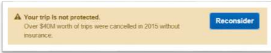
Figure 3---Illustration of Website Designed to Encourage Add-on Pricing

The market for video games is an interesting example of the third of these reasons. When video games were on physical media such as tapes and were sold in brick and mortar stores, the games tended to exist in one flavor and were sold for one price. As the technology of delivering the games and of receiving payment evolved, in-game purchases, unlocking new functionality, and purchasing various quality levels became not only feasible but also pervasive. Airline tickets have followed a similar trend, as airlines have become able to accept payments for early boarding, more legroom, and other amenities at unmanned kiosks in the airport and credit card payments onboard for drinks and food. Figure 4 is an illustration of a video game in-game purchase.