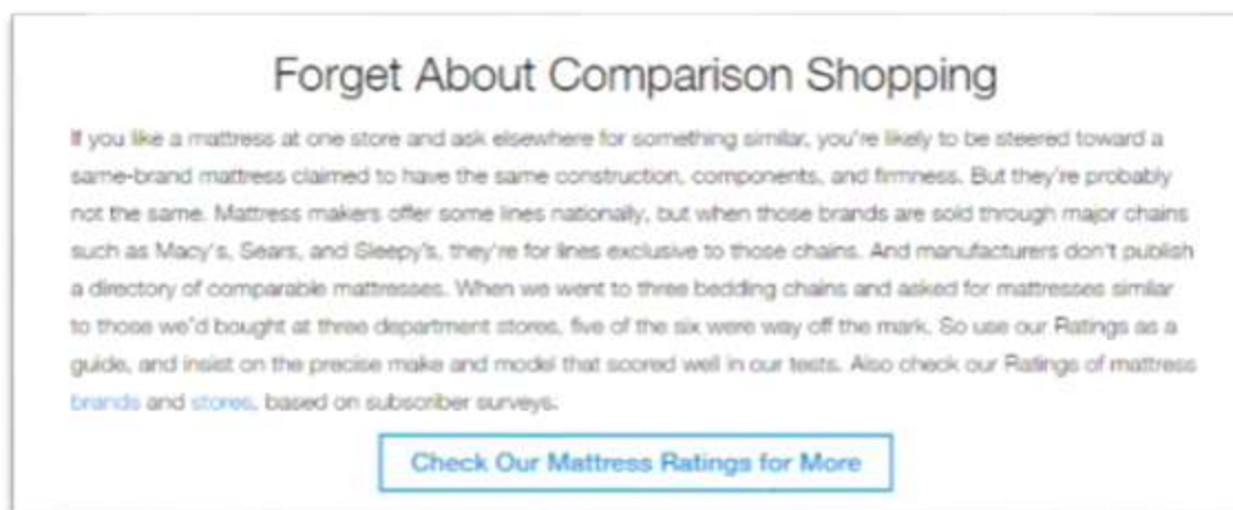
Figure 2---Obfuscation in Mattresses

These are all common and pervasive forms that obfuscation can take, but our focus will be on a particular type: add-on pricing. Let us start with a personal recollection. Several years ago, while shopping for a camera, we stopped in at a local store. This camera store had a reputation for good prices, and in fact advertised very low prices in the newspaper. We requested a particular model from the sales clerk, which he produced at the low advertised price. We then asked whether they carried spare batteries, carrying straps, and cases. “Of course,” the sales clerk replied. “We’d be crazy not to---that’s how we make our money.” This example is a good illustration of the phenomenon: we can think of add-on pricing as the practice of offering additional features, options, complementary products, and quality upgrades to a basic