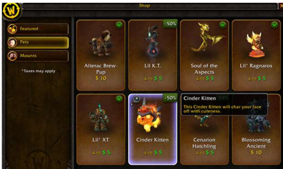
Figure 4---In-game Purchase in Video Game

The market for video games is an interesting example of the third of these reasons. When video games were on physical media such as tapes and were sold in brick and mortar stores, the games tended to exist in one flavor and were sold for one price. As the technology of delivering the games and of receiving payment evolved, in-game purchases, unlocking new functionality, and purchasing various quality levels became not only feasible but also pervasive. Airline tickets have followed a similar trend, as airlines have become able to accept payments for early boarding, more legroom, and other amenities at unmanned kiosks in the airport and credit card payments onboard for drinks and food. Figure 4 is an illustration of a video game in-game purchase.