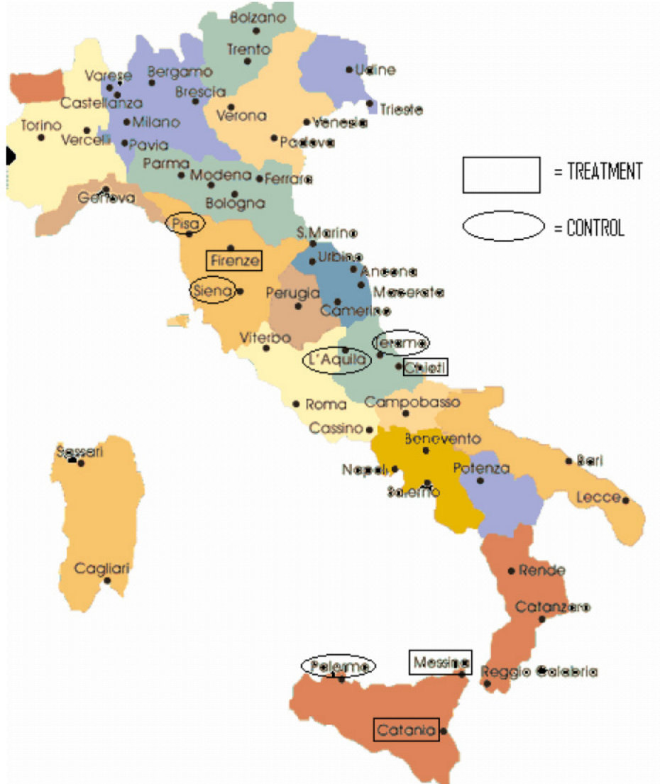
Fig. 2.— Regions with both AlmaLaurea and Non- AlmaLaurea universities